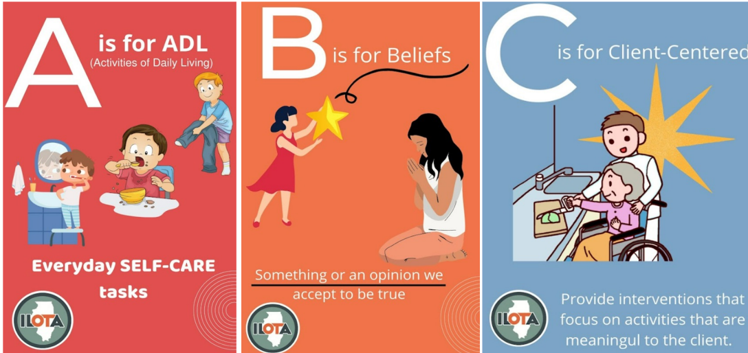
ABCs of OT Example Infographics