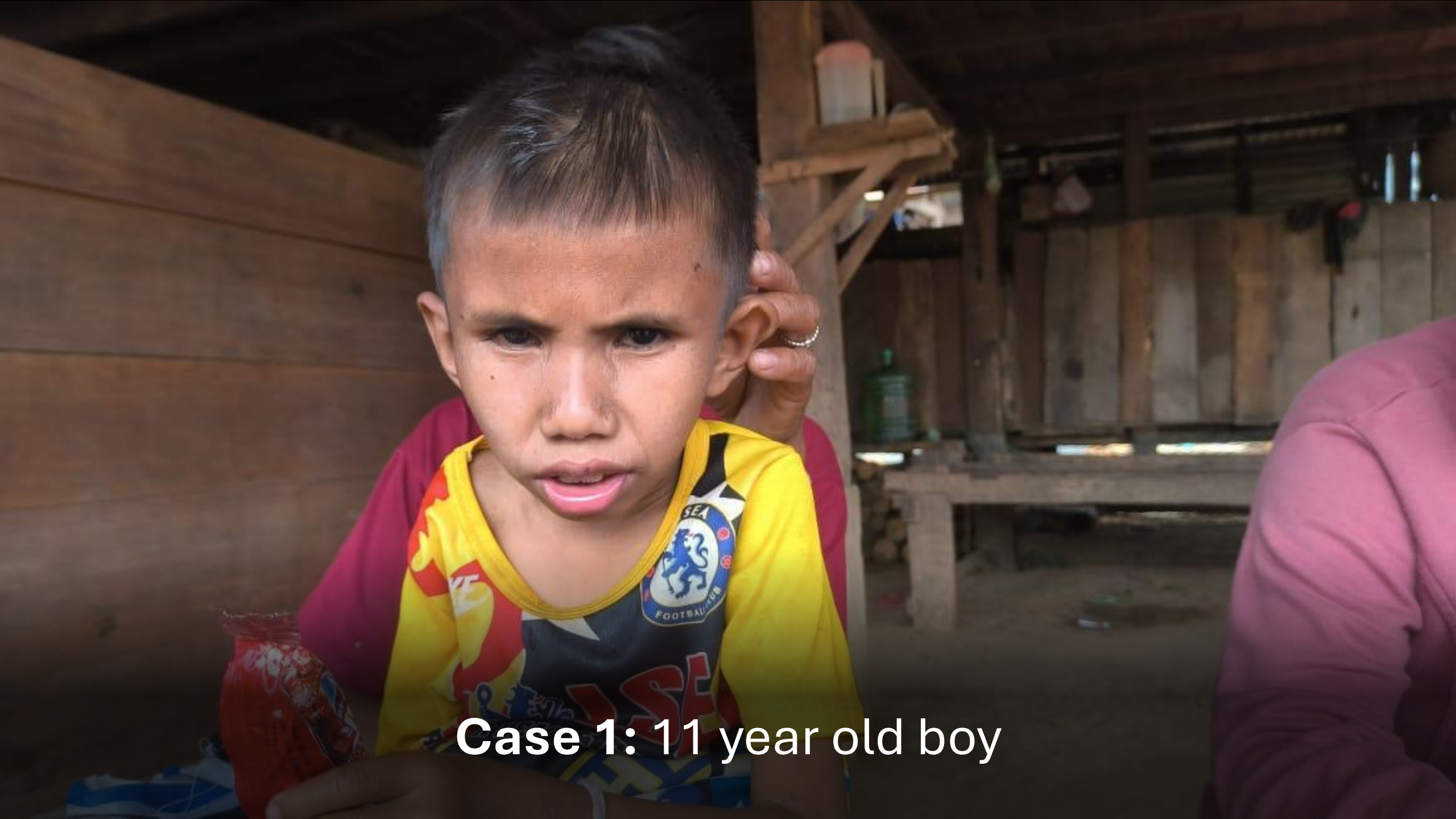
Case 1: 11 year old boy