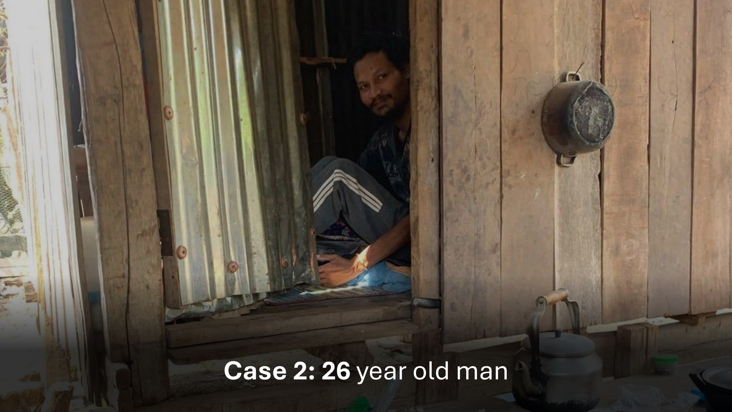
Case 2: 26 year old man