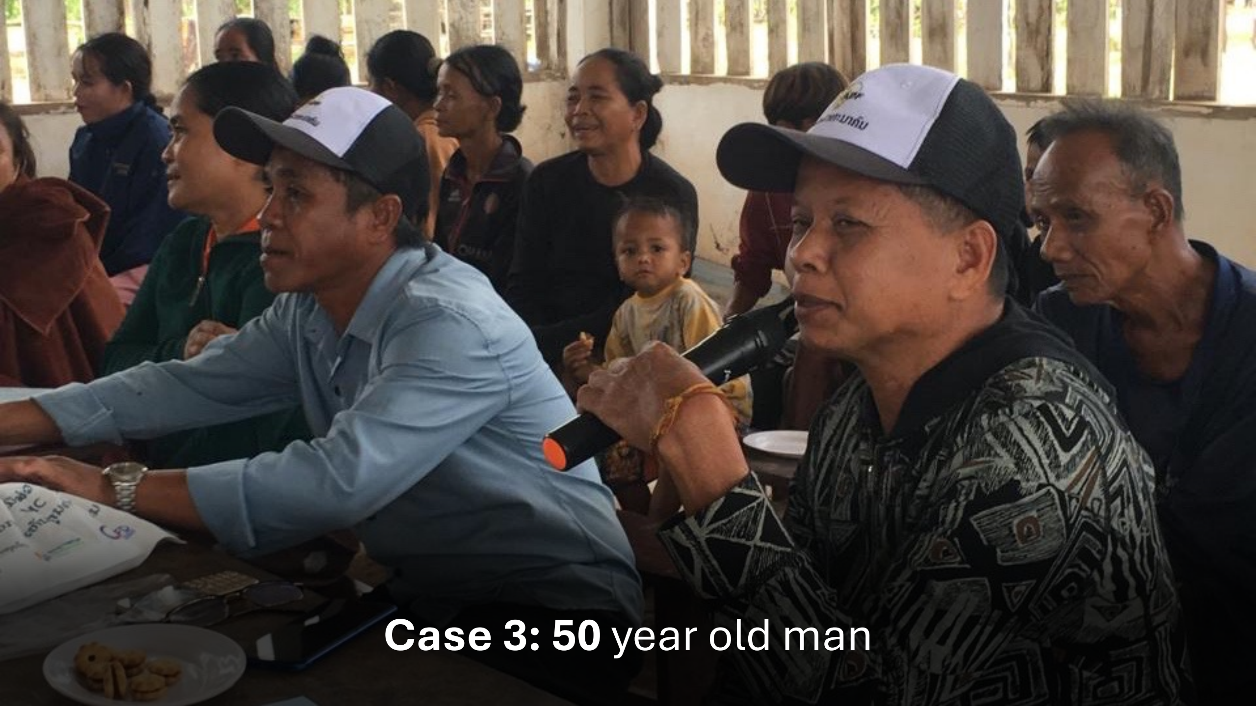
Case 3: 50 year old man