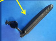
custom made tray