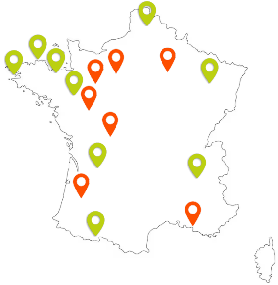
Figure 2 : Center included in ELEOPS (n=9)