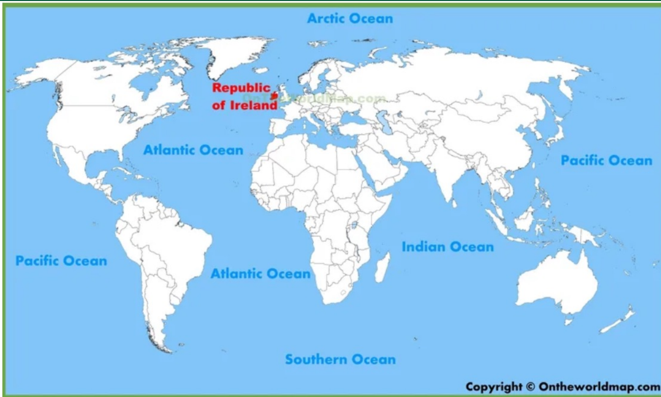
University of Limerick