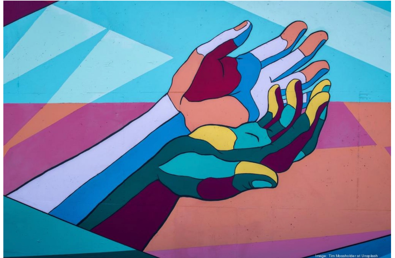
Figure 5: Calbeaux (2021)