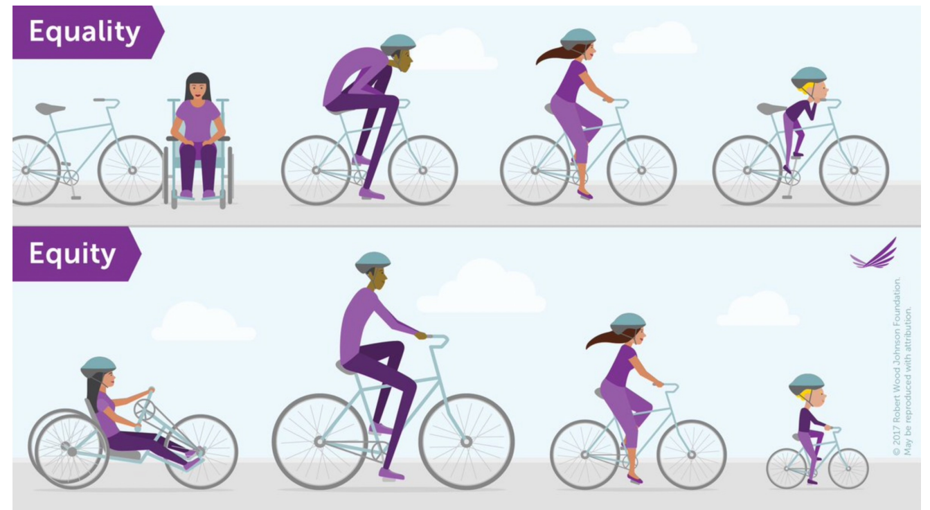
Figure 4: Daniel (2019)

Equity is reducing implied or explicit barriers to create access to opportunities for all.