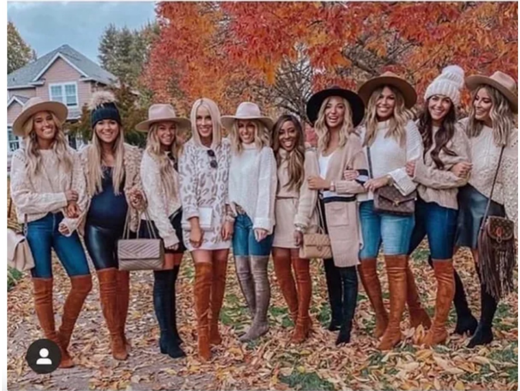
Figure 1: Facebook (2026)

If all the different spellings of “Ashley” was a picture..